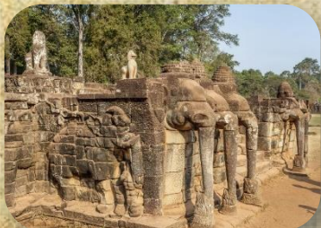
Terrace of the Elephants