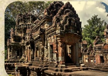
Chao Sey Tevoda Temple