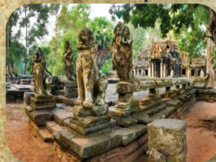
Bontey Kdey Temple