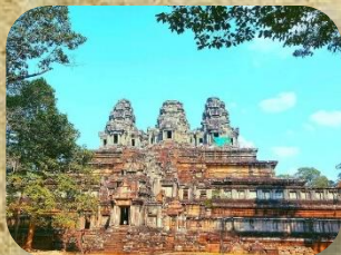
Ta Koe Temple