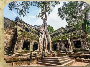
Taprom Temple (Tomb Raider)